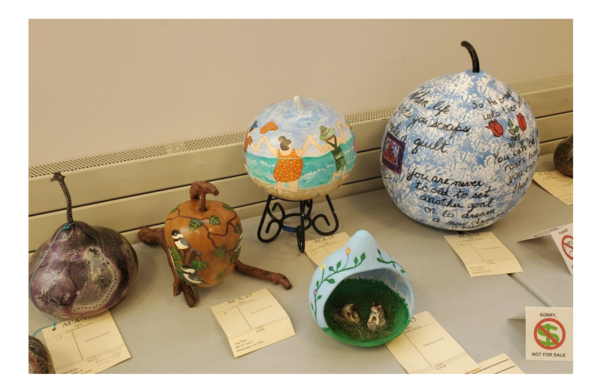
Some general displays in competition