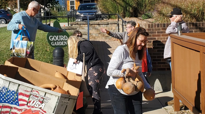
Dry gourds for sale outside the library