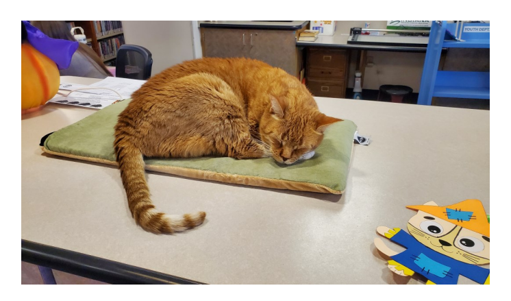
Visitors entering the show through the library entrance were "greeted" by Chance, the library cat.