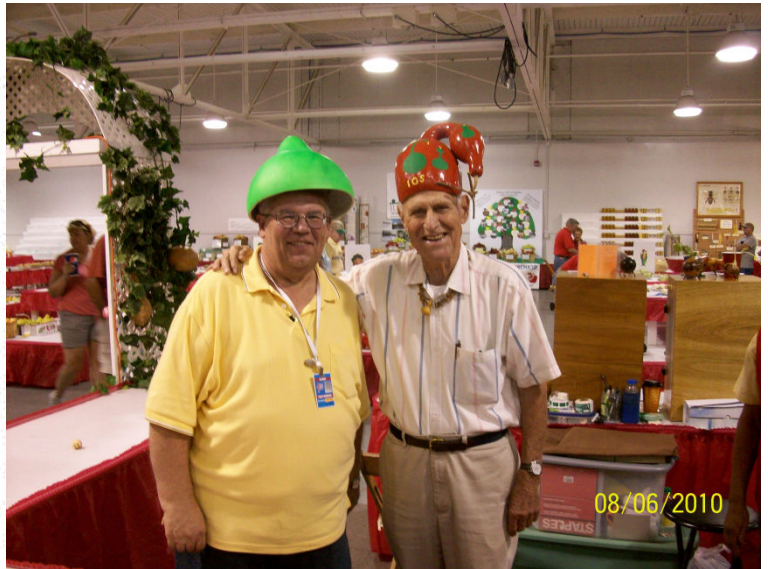
Do you recognize these two gourd nuts?

Note: Items over budget were approved by board vote.