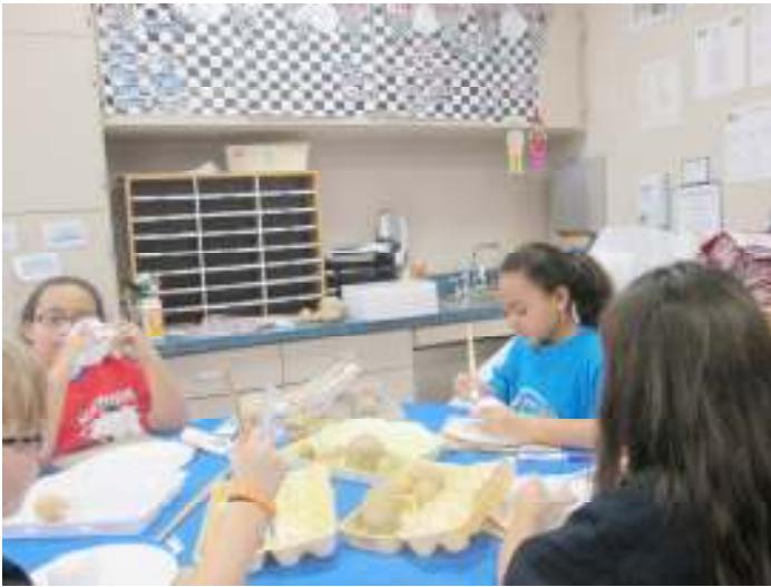
Brushing away with a base coat.