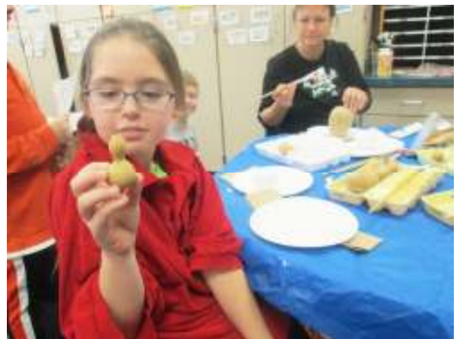
Hmmm! What am I going to do with this?