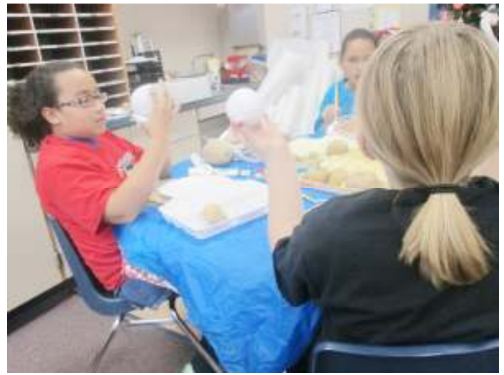
I have paint all over my fingers!