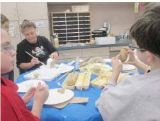
Hey! This gourd has a hole in it, right there!