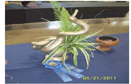
There's always a new twist on what you can do with gourds isn't there?