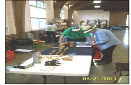
There were also many displays to see and ask questions of the experts..