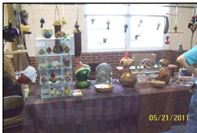
The birds were sitting watching everyone go by. Hey, if you Tweet, have a Tweety Bird gourd nearby.