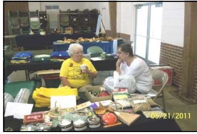
There was time for chatting with friends and catching up on all the news.