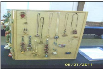
Gourd related necklaces, decorative pieces, and gourd jewelry pieces. Some very imaginative crafting here!