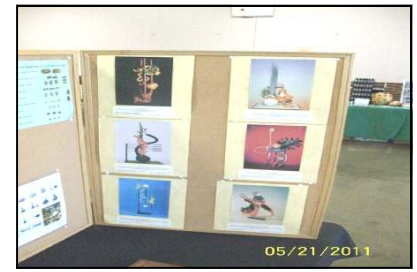
And these are the long-handled gourds shaped and crafted into jewels of flower containers and decorative