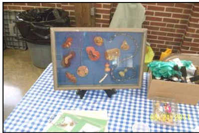
A very nice show case of gourd jewelry pieces and necklaces attracted many festival attendees.