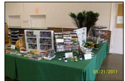
Of course you need to dress up all of those gourds you have with a bit of paint, gold leaf, feathers, or lace too.