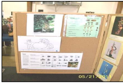
This story board was all about gourd seeds, gourd varieties, and growing.