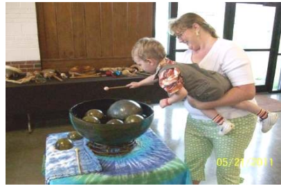
All boys like noise makers and the drums delighted "The Little Drummer Boy" & it looks like Mom enjoys it!