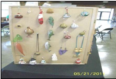
WOW! Lures, carrots, Santa, necklaces, baubles, and snowmen all on one board and it actually looks very