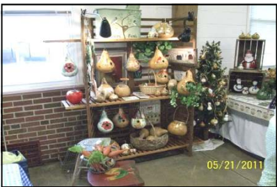
Lot's of birdhouses around the show, but, YUM, look at those carrots! Now how did they grow like that?