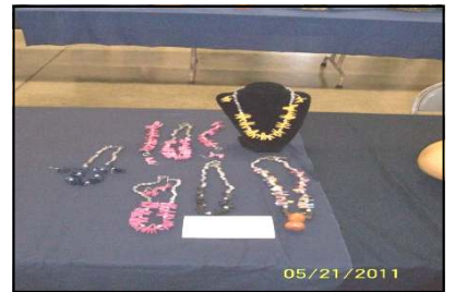
A very nice display of a variety of gourd seed necklaces. These have Jobs' Tears half way down for comfort.