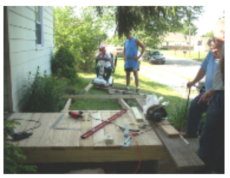
Honey Bear watching all of the work.

An extra step was added for trips to the mail box