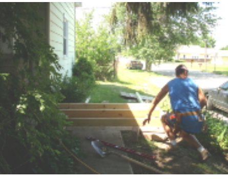
Getting the platform leveled—just right.

Honey Bear made several trips up and down the ramp to make sure it worked!