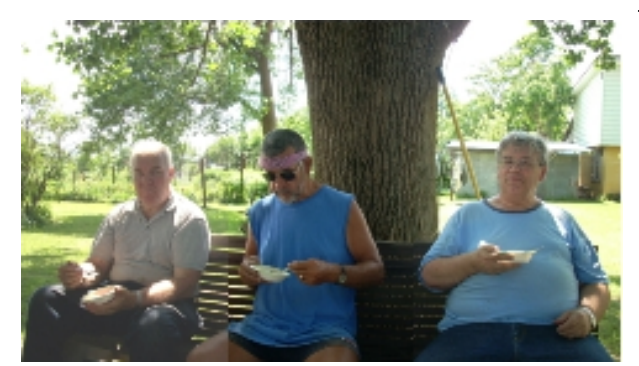
Eating the rewards. With a little copying, cropping and pasting we got all three of these guys into one frame