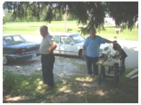
Measure twice, cut once, making sure it fits.